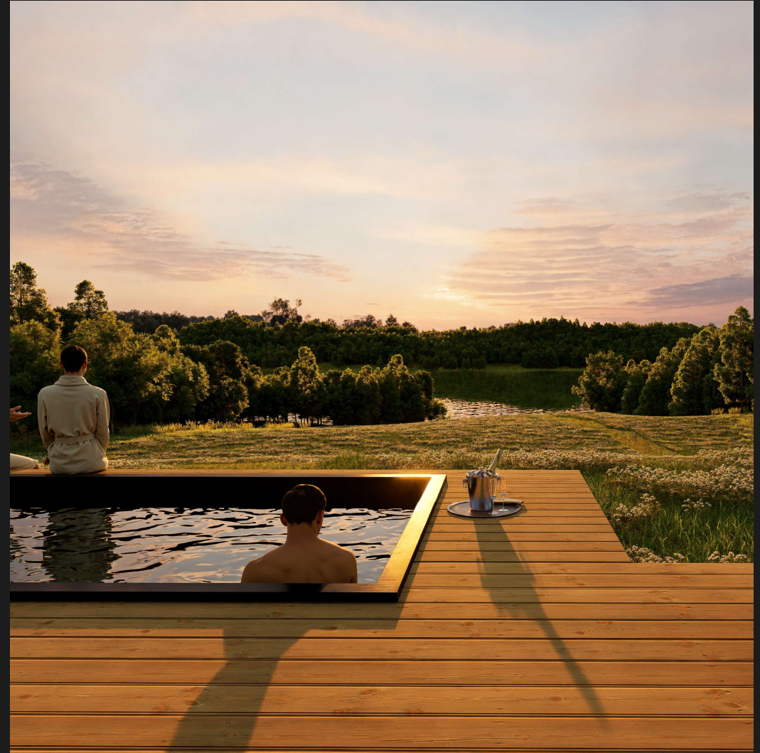
A glimpse of the suite and terrace, spaces designed for stillness, comfort, and a deep connection to nature