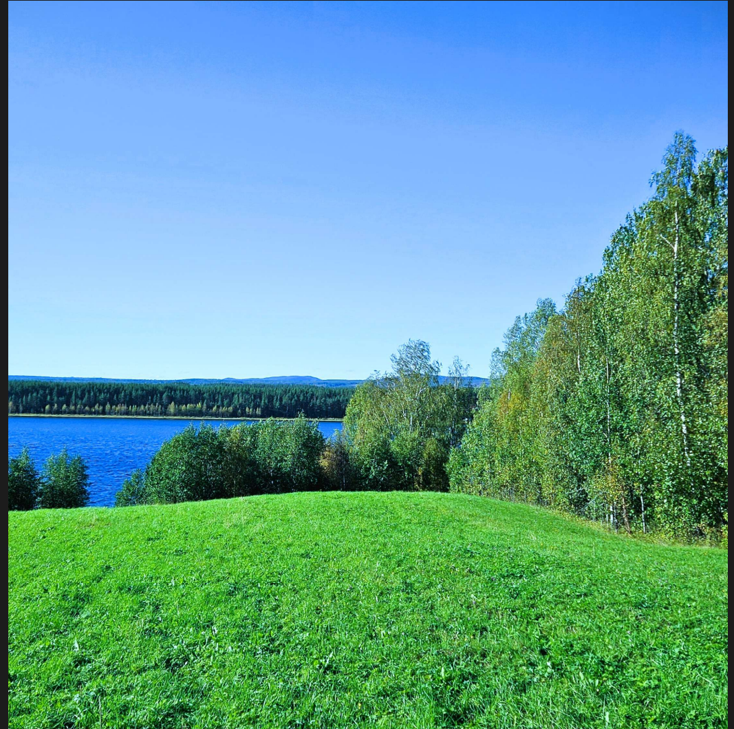
Winter and summer views of the meadow from Villa ÄNG